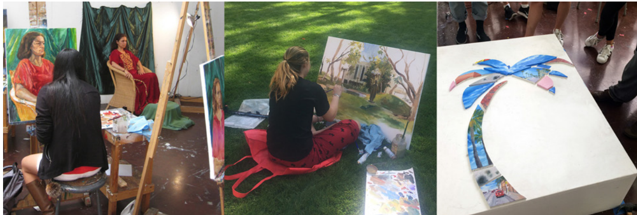
Painting from the model