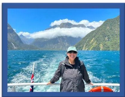
Milford Sound, New Zealand, 2022