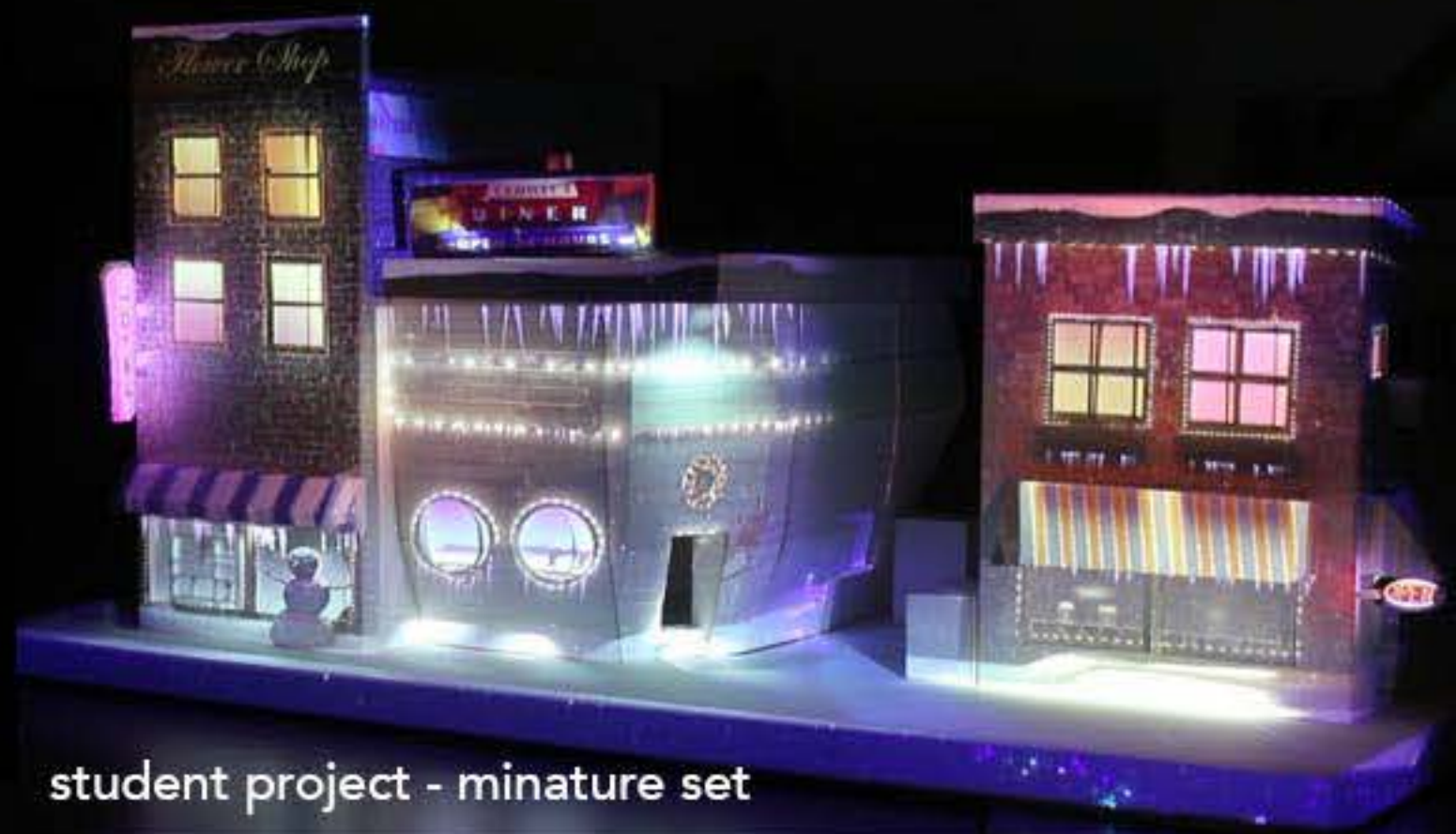
student project - miniature set