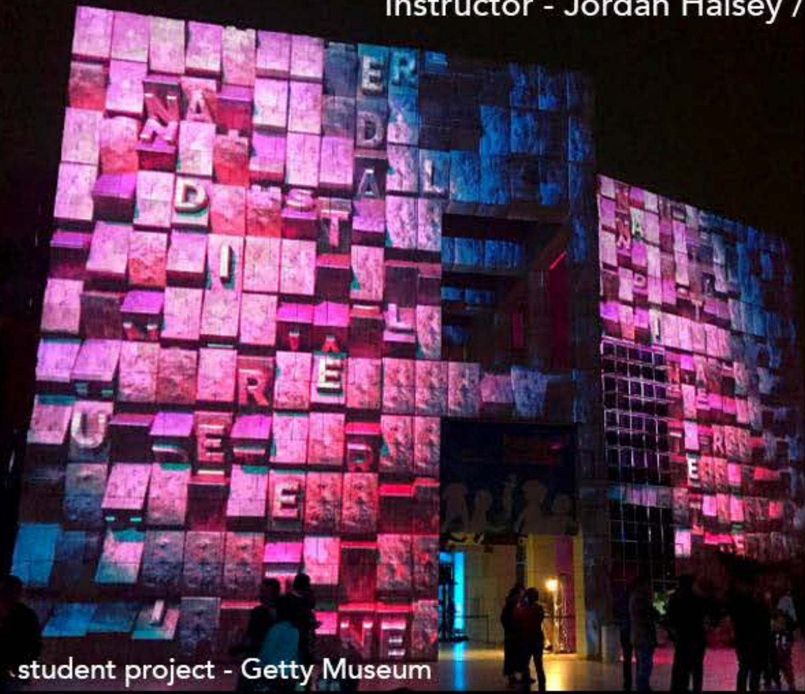
student project - Getty Museum