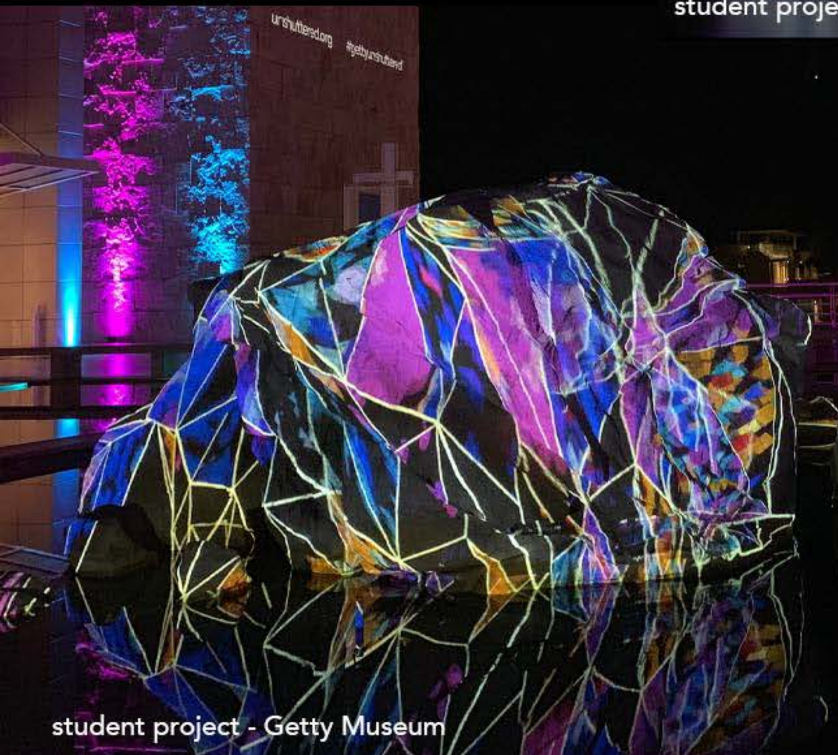
student project - Getty Museum