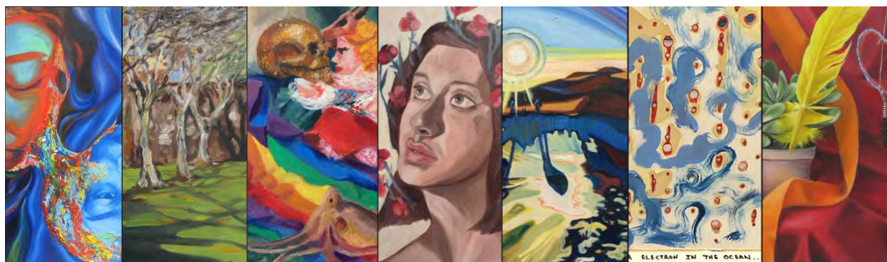
Details from ART-120 student paintings

*This course counts toward the Painting, Drawing, and Two-Dimensional Studies Minors*