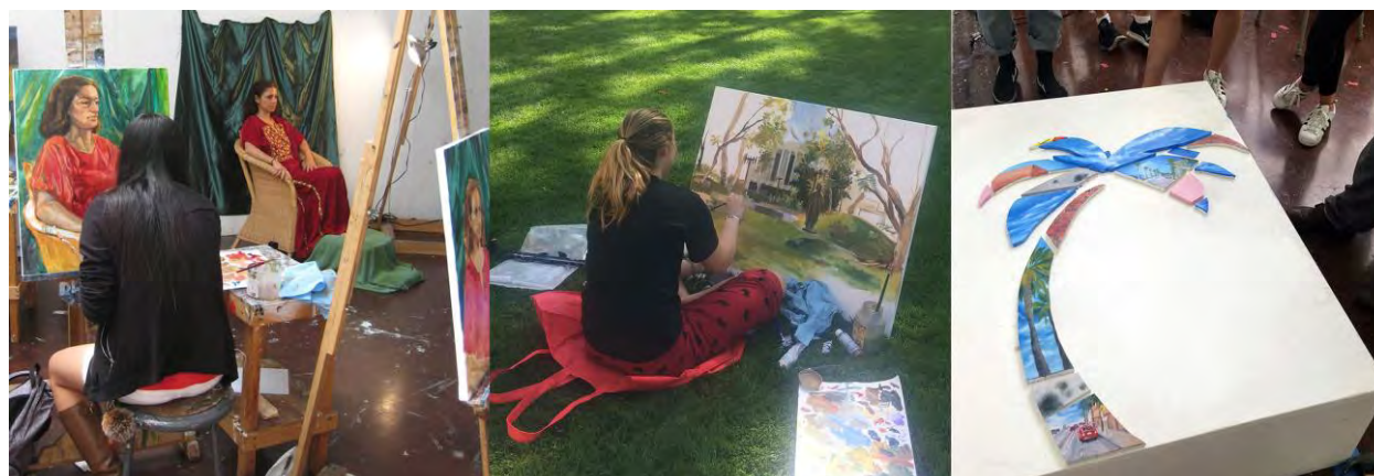
Painting from the model