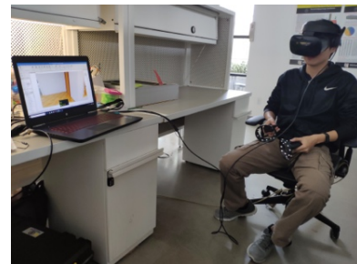
Spring 2019: Visitor center renderings in Enscape and Revit (507). (George Yang)