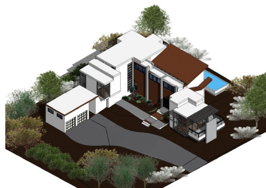
Spring 2016, Arch 307. Magdalini Vraila