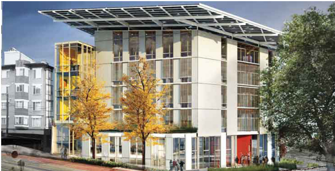
Figure 1- Bullitt Center, Miller Hull, Zero Net Energy (ZNE) building, Living Challenge building.

https://www.seattleu.edu/uploadedImages/Center_for_Environmental_Justice_and_Sustainability/Content/About/Bullitt%20Lovely%20Light.jpg?n=4326