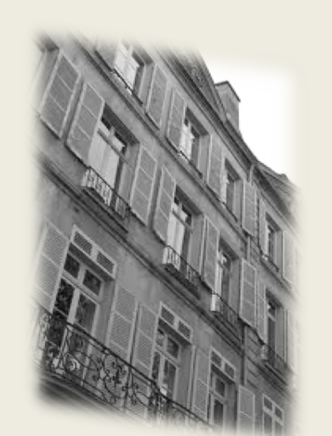
La description d'un lieu