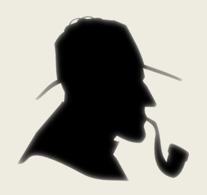
Le roman policier