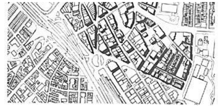
Government Center, Boston, MA

Office hours: Wednesdays 11am-12noon, in VPD lower level lobby