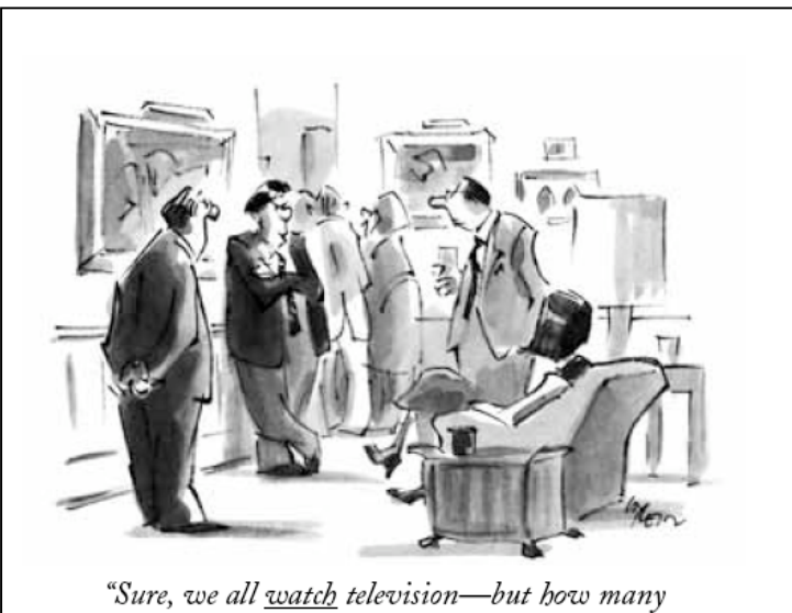
"Sure, we all <u>watch</u> television—but how many of us really <u>see</u> television?"